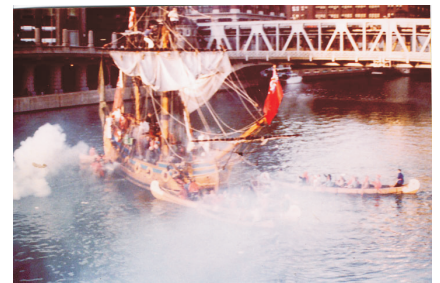
The Nonsuch under attack by voyageurs in Chicago (1969)

While touring the Great Lakes, a society of voyageur enthusiasts in Chicago made arrangements to visit her in "traditional fashion". The master of the Nonsuch was well prepared and as 75 voyageurs in ten canoes converged on the vessel, they were met with a barrage of cannon fire followed by volleys of flour bombs. Notwithstanding this defensive action, the assailants prevailed and were soon in possession.